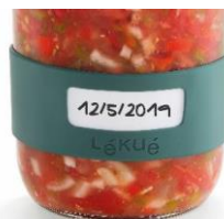
Silicone case with label holder window