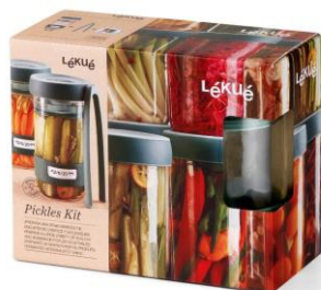
Recipes are included in the pack