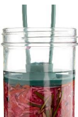
Adjustable pressing disc