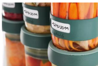
Stackable design, unique on the market