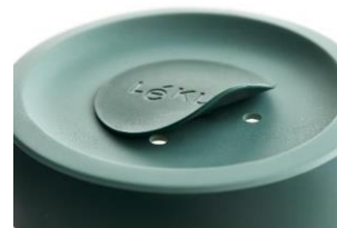
Exclusive safety silicone valve on the lid